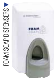
▼ FOAM SOAP DISPENSERS