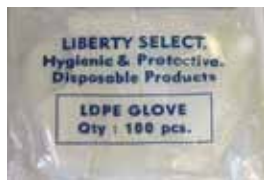
LIBERTY SELECT Disposable Gloves 100 x 100's