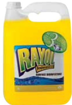
RAYOL Surface Disinfectant 5 L