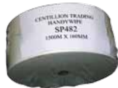
CENTILLION Handy Wipe 1500 m x 160 mm