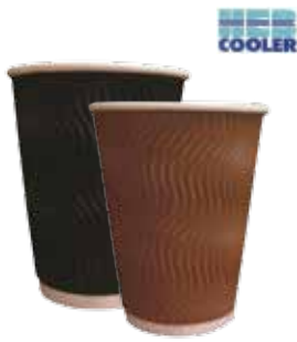
HEB COOLER Wave Cups 1000's 250 ml / 350 ml / 500 ml