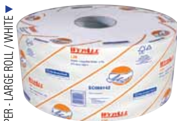
WYPALL* L30 WIPER - LARGE ROLL / WHITE