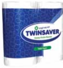
NAMPAK Toilet Paper 1 Ply / 2 Ply