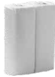
NAMPAK Elite Roller Towels 24's