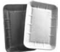
MONDI Fomopak No 49