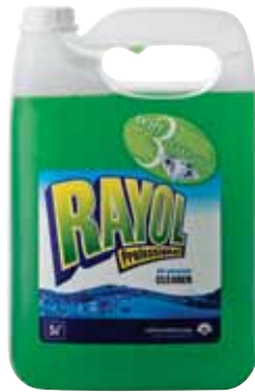
RAYOL All-Purpose Cleaner 5 L