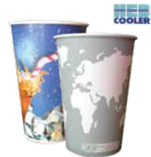
HEB COOLER Printed Cups 1000's 250 ml / 350 ml / 500 ml