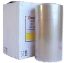
MONDI Versafilm 1500 m x 300 mm 1500 m x 330 mm 1500 m x 380 mm