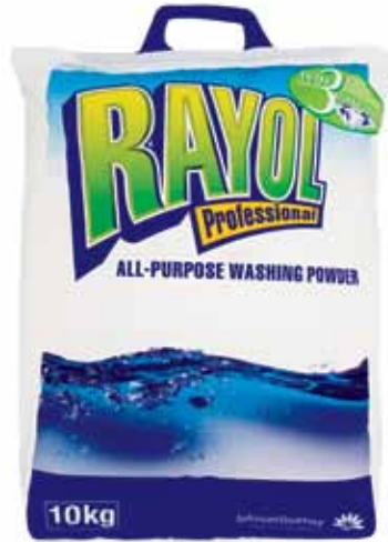
RAYOL All-Purpose / Auto Washing Powder 10 kg