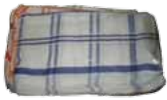
LIBERTY SELECT Dish Cloths HC No 6 36 x 10's