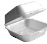
MONDI Fomopak No 6