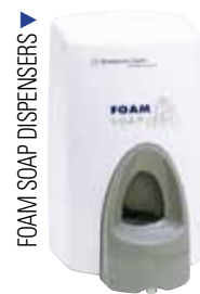
FOAM SOAP DISPENSERS