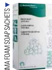
▼ ANTI BAC FOAM SOAP & DERMA FOAM SOAP SACHETS