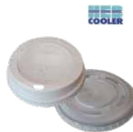
HEB COOLER Sip Lid / Straw Lids 1000's 250 ml / 350 ml / 500ml