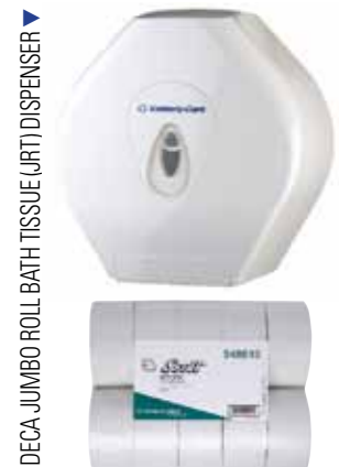
▼ DECA JUMBO ROLL BATH TISSUE (JRT) DISPENSER