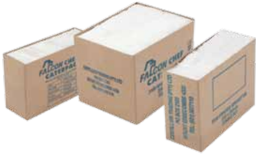
FALCON CHEF Serviettes 2 Ply 1000's 330 mm x 330 mm