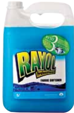
RAYOL Fabric Softener 5 L