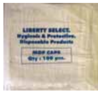
LIBERTY SELECT Disposable Mop Caps 20 x 100's