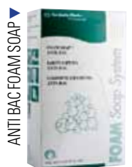
ANTI BAC FOAM SOAP

KIMBERLY-CLARK PROFESSIONAL* Providing health, hygiene and productivity solutions