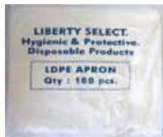
LIBERTY SELECT Disposable Aprons 20 x 100's