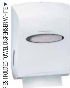
▼ SERIES 1 FOLDED TOWEL DISPENSER WHITE