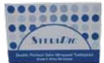
STERIPIC Toothpicks 24 x 1000's