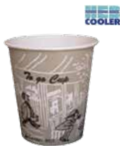
HEB COOLER Ready to Go 1000's 250 ml / 350 ml / 500 ml