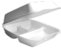
MONDI Fomopak 3 Division No 53