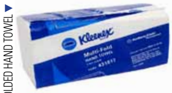
▼ KLEENEX® MULTI-FOLDED HAND TOWEL