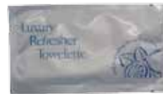
LIBERTY SELECT Luxury Refresher Towelette 10 x 50's