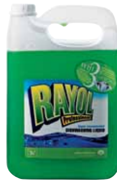
RAYOL Dishwashing Liquid 5 L