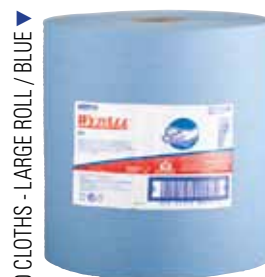
WYPALL* X60 CLOTHS - LARGE ROLL / BLUE